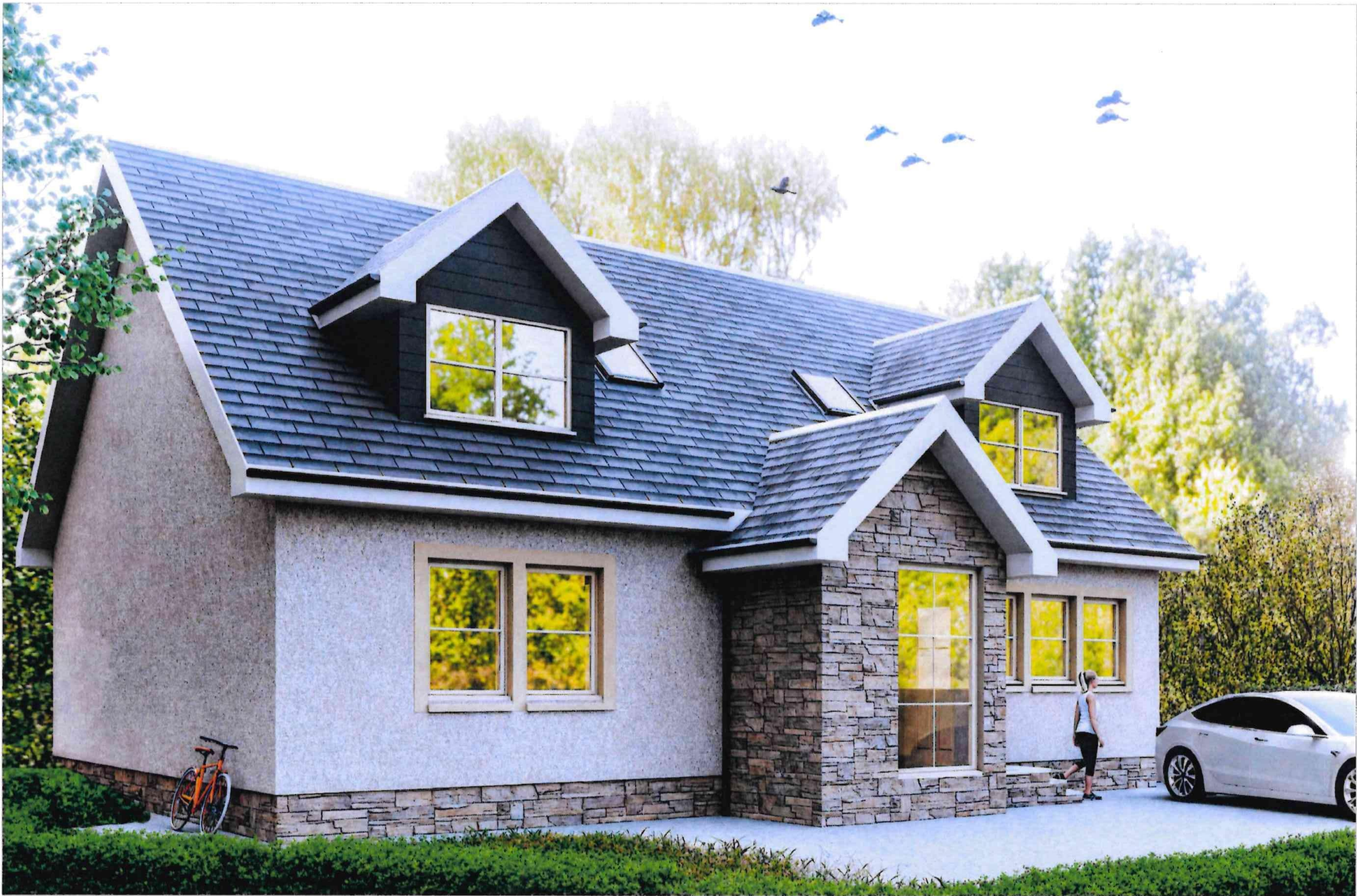
House Type Artist Impression